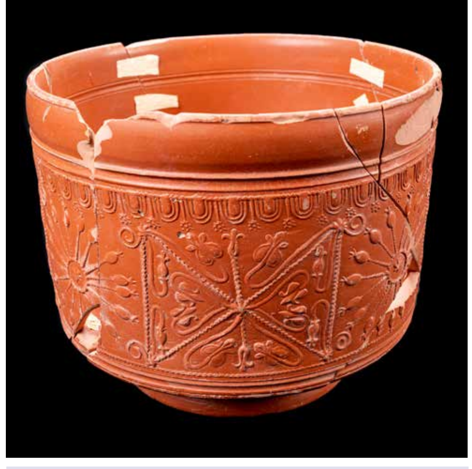
Near complete Samian bowl found along the route of the Arborfield Cross Relief Road

Welcome to our new edititon of Berkshire Archaeology News