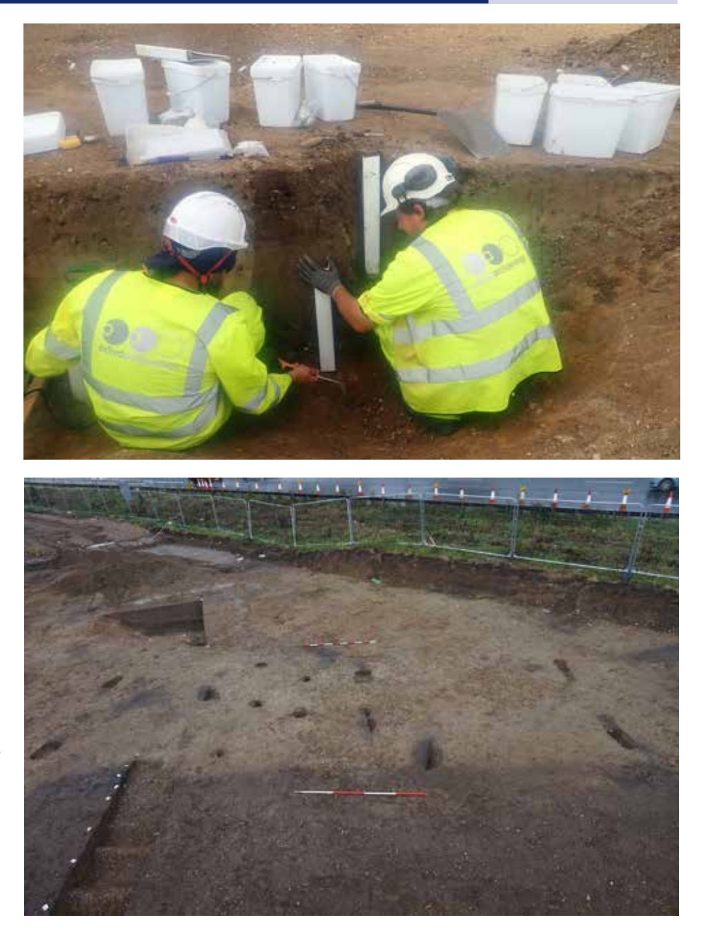
Sampling a prehistoric ditch for environmental remains

The Myrke is a small outlying settlement in the former parish of Upton, now part of Slough. It sits on the former road to Datchet before the arrival of the M4 saw the Datchet Road diverted to the east. Until the early 20th-century, the settlement was called 'Mirk'. Perhaps the change in spelling was to provide the residents with a more enigmatic name to the less flattering similarity to 'murk' or 'murky'. The name may actually derive from the Old English 'mearc', meaning boundary, as the settlement lies on the boundary between the former parish of Upton (now Slough) and Eton. The long history of settlement in the area was recently demonstrated by archaeological investigations in advance of the construction of a temporary compound for the M4 Smart Motorway improvements. In the triangle of land just east of The Myrke and Datchet Road, Oxford Archaeology, on behalf of Highways England and Balfour Beatty Vinci JV, found a series of repeatedly re-dug ditches running across the site. The earliest may date from the late second millennium BC (around 1,100 BC) and the ditches may have been maintained and re-dug into the later Iron Age (around 200 BC). They may have marked and separated a natural spring and stream running across the site from adjacent fields and settlement. Close to these ditches were a number of other remains, including a well, since abandoned, with the remains of a butchered cow towards the base!